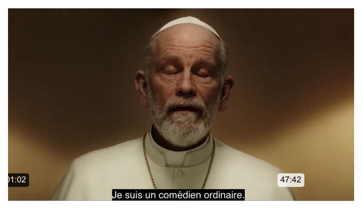
Epiphany from ancient Greek Ἐπιφάνεια (Epipháneia) which means "manifestation" "appearance" "evidence", "to come in sight".

A sung, danced and musical work for all those anxious, suffering, poor and confused. A work for the entire planet therefore.