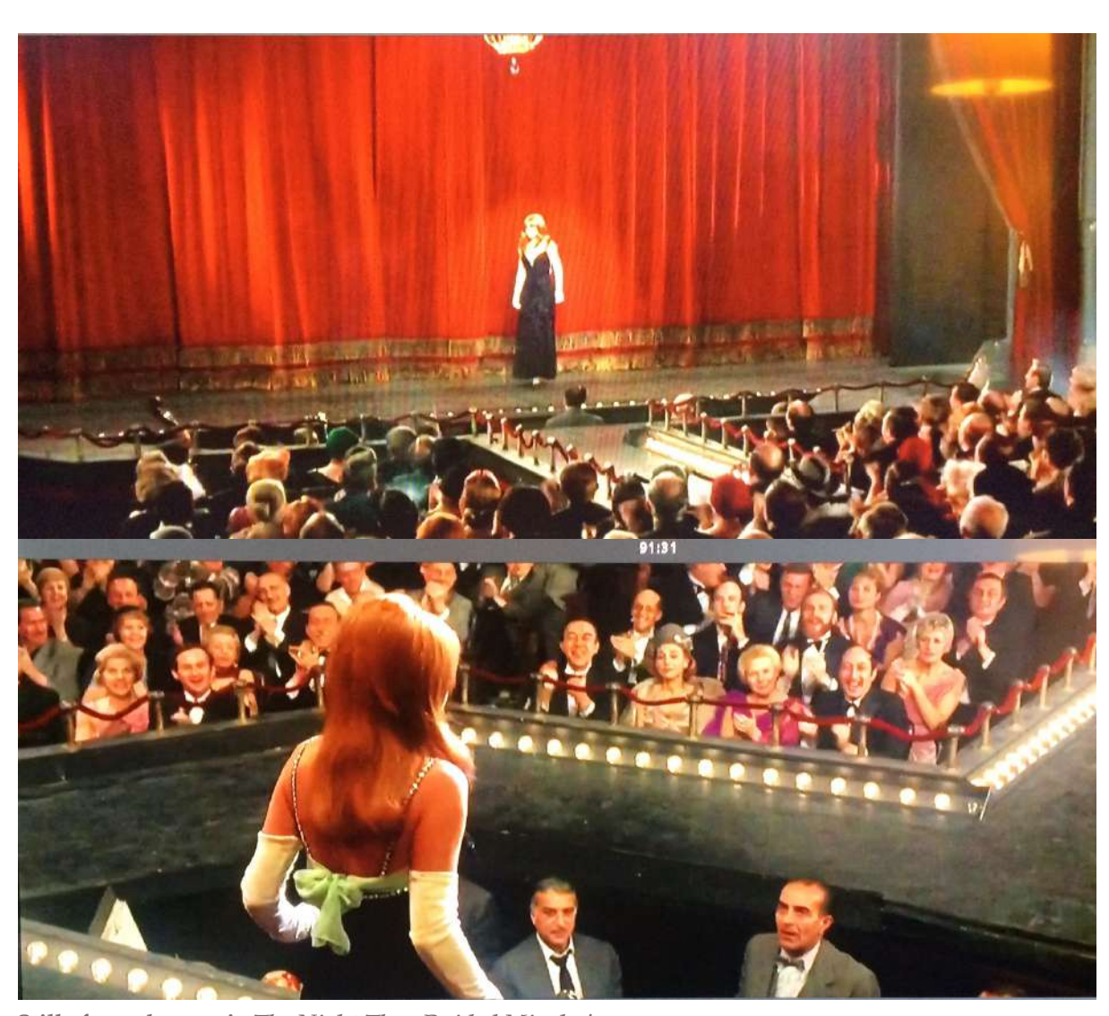
Stills from the movie The Night They Raided Minsky's

The scenography of My Epifunny borrows its form from the Burlesque or Music-Hall. The stage will be "empty", without any decorative elements, but we will add an extension, a ramp such as we often also see in fashion shows. A ramp which "invades" the audience hall. It is in collaboration with the scenographer Bruno Faucher that we are developing this aesthetically contemporary device that puts a definitive end to the distance restrictions linked to COVID-19. The ramp will allow us to find ourselves "in the middle" of the audience, to erase the traditional distance between performers and the audience and to create "solo" moments in the show.