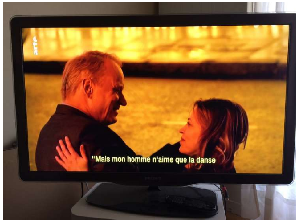
Nicola Walker and Stellan Skarsgard in the series "River"

Working on a creation with my main performers gives me hope that the range of dance language will range from popular dances to classical or contemporary dance. From Polka to non-dance. Unlike the musical where the dance is only an "accompaniment", in My Epifunny the movement will be as expressive and abstract as a spoken language.